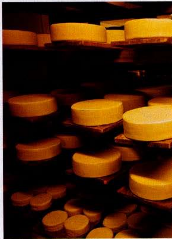
Wheels of fortune: Rounds of rich homemade cheeses ripen in Hacienda Zuleta’s dairy factory. Fertile volcanic soil nurtures a wealth of flora at Hacienda San Agustín de Callo (opposite, top), a haunt of the former president of Ecuador Leónidas Plaza. Breakfasts here offer both Andean and continental fare (opposite, bottom).

I HAD HEARD THAT Ecuador boasted a passel of haciendas that have maintained their vitality and traditions in part by opening their doors to tourists like me. Still owned by Ecuador’s former aristocracy and known for their ranch-style hospitality, they offer a glimpse of authentic hacienda life, a lifestyle that includes fine horses, regal accommodations, and bountiful meals. As a connoisseur of lodgings around the world, I jumped at the chance to immerse myself in the rich culture of Ecuador in the most immediate way: by staying in some of these centuries-old, family-owned, and sustainably managed estates.