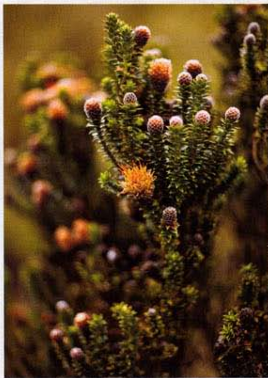
Edelweiss of the Andes, high-altitude chuquiragua plants (above) bloom in Cotopaxi National Park, where rolling volcanic terrain lends itself to brisk mountain-biking excursions (opposite, top). Schoolgirls bearing celebratory lanterns parade to an elementary school near Zuleta to elect the new class queen (opposite, bottom).