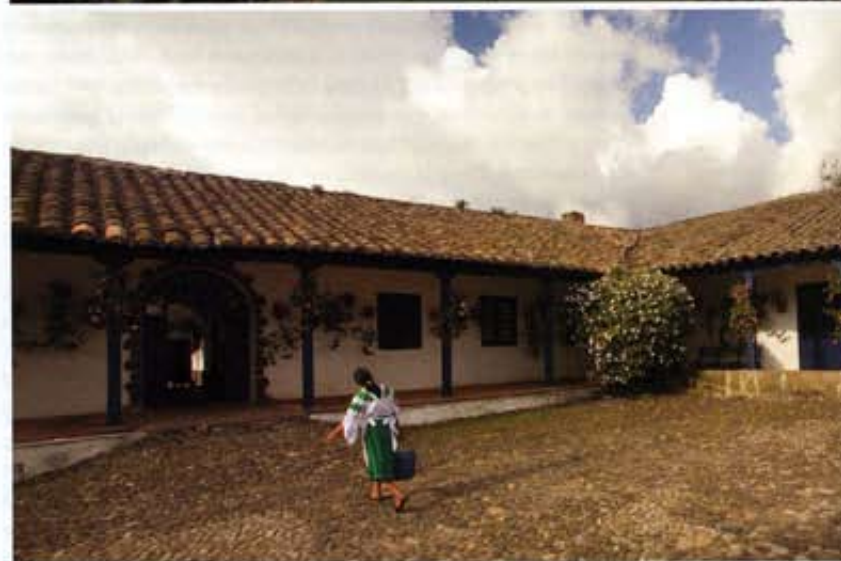
Top: A local milking shed. Top right: Aerial view of Hacienda Zuleta. Bottom: The cobblestone courtyard at Zuleta.