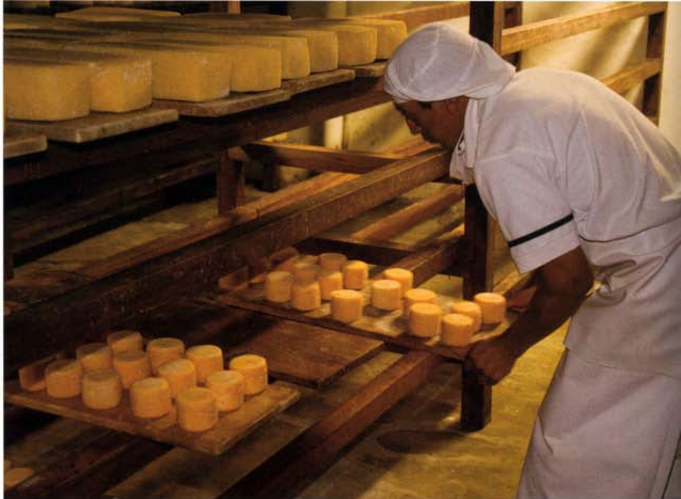
Top shelf: Angochagua, a Port-Salut style cheese. Lower shelf: Pategras, a mild cheese similar to Edam.

a protective barrier. Natural flora present in the rooms work to give the cheeses their distinct characteristics, with the aid of thermophilic (high-temperature resilient) and mesophilic (moderate-temperature enduring) starter cultures. The finished cheeses are then washed, dried, and hand-dipped in wax before being readied for packaging and shipping.