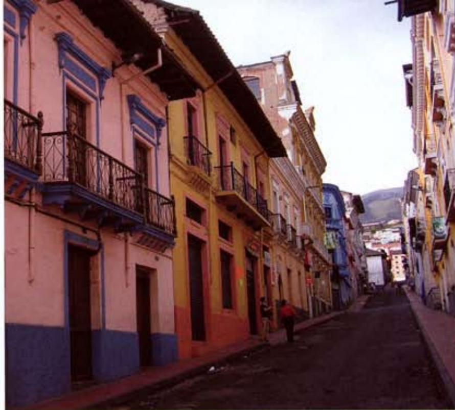
Street scene in Quito.