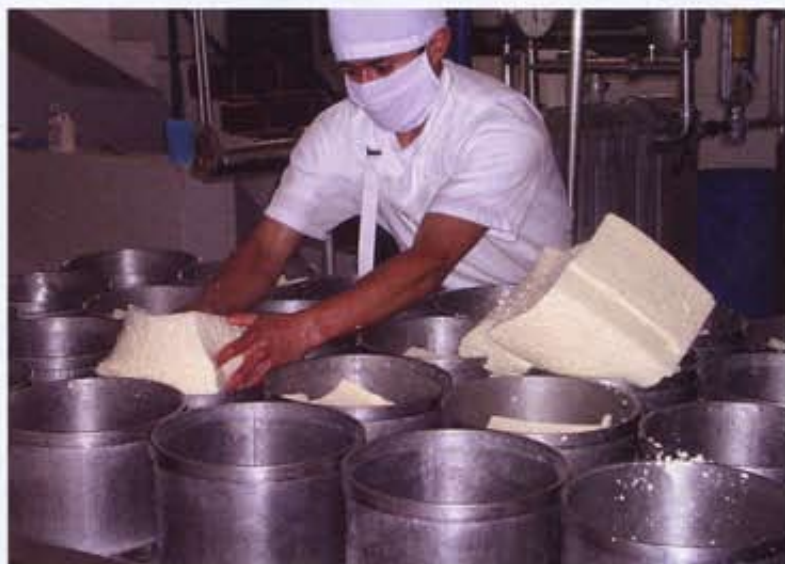
Production of young Andino: Top left, pressing curd under the whey. Above, cutting the curd. Left, placing the blocks of curd into molds.