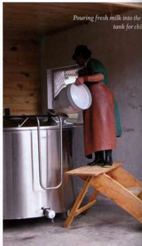
Pouring fresh milk into the tank for ch