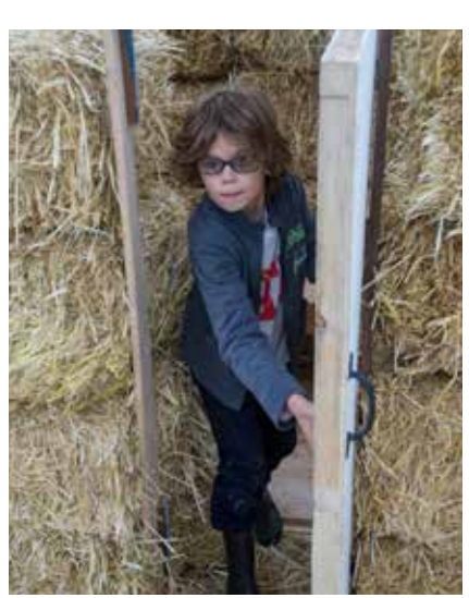
Duration: 2 hours Minimum age: 5 years old